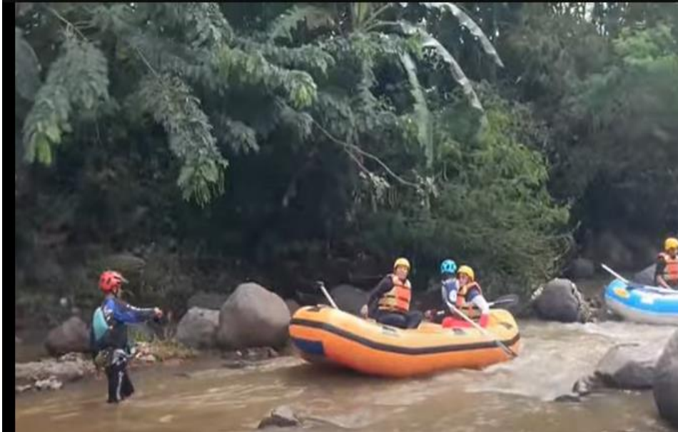
Picture 3 of the Cimanis River qualification test

natural features and cultural traditions that can be appointed as quite interesting tourist attractions.