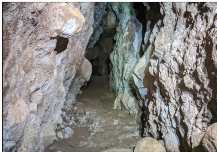
Picture 1 Liang Putri Stone Petilasan Site

Not staying still, Sibadugangjaya finally found the princess's hideout; without thinking, Sibadugangjaya put a taming bamboo into the hole. In order to trick Sibadugangjaya, the Putri finally spit on the bamboo using his saliva, which was still mixed with red lining. Thus, Sibadugangjaya thought that the Princess was dead because on her bamboo taming, there were blood stains, which, in fact, was the Princess's saliva mixed with the king. Until now, the site has been a stone with a hole called Liang Putri, located at the Kertawangun or Panambangan border.