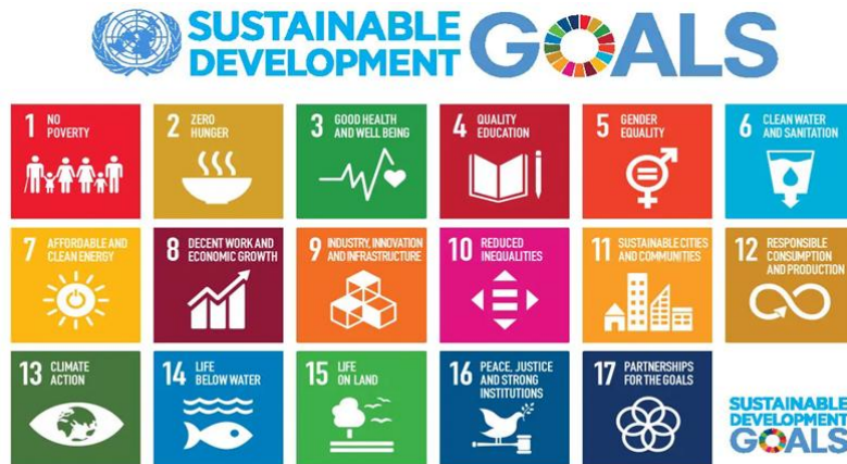
Figure 1. Sustainable Development Goals