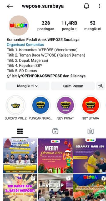
Figure 3. Official Account of WEPOSE Surabaya Children's Welfare Community

This section will discuss the research findings on the WEPOSE community's efforts to support quality education in Surabaya and Generation Z's active role in realizing the Sustainable Development Goal (SDG) 4, particularly in areas still facing social and educational challenges.