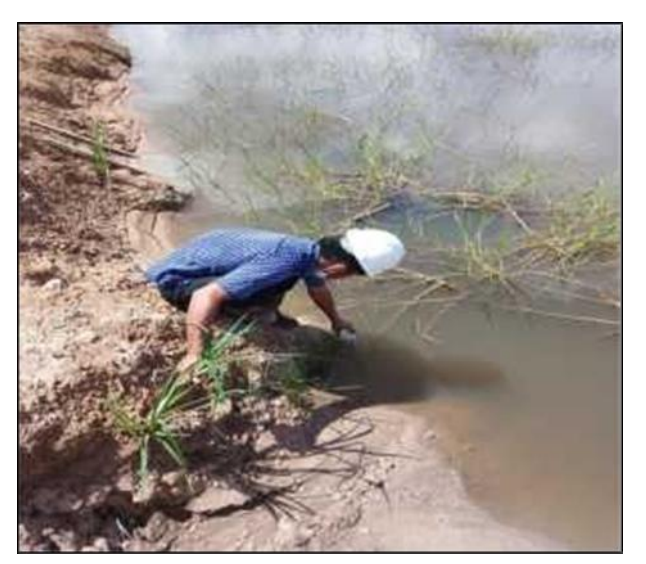
Figure 7. Water Sampling at the Last Sludge Sedimentation Pool (Outlet)