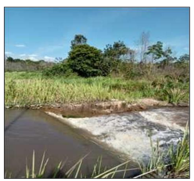
Figure 9. Mine Acid Water (AAT) on the Last Outlet Line

Sealing is the last stage in the mining acid water (AAT) management process carried out by PT Lematang Coal Lestari (LCL). Deposition aims to deposit water or precipitate suspended solids and dissolved metals at the AAT to the maximum, with a deposition duration that is not fixed or by the turbidity level at the AAT. After tapping, the next step is to dispose of it, provided that the AAT is clear enough in color and has a minimum water pH of 6. The disposal of the AAT is carried out by opening the sluice gate at the last settling pond of the last outlet (Figure 4.9).