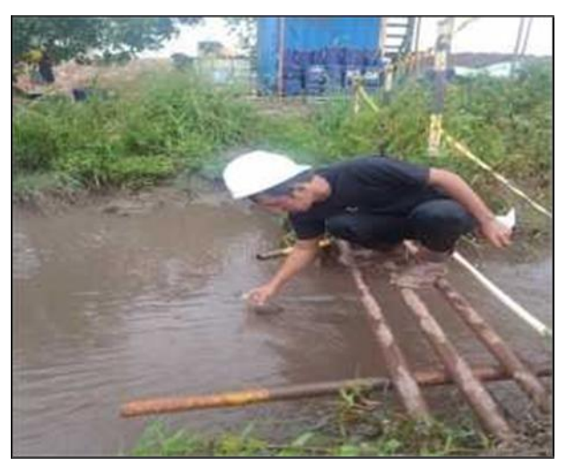
Figure 5. Water Sampling on Inlet Canal Source: Documentation, 2023

The pH (potential hydrogen) measurement of water at PT LCL uses litmus paper, so the pH value of the water measured does not show a detailed number. The pH (potential hydrogen) measurement of inlet water is carried out in the connecting channel or ditch between KPL 1 and KPL 2 (after mixing chemical organic coagulant) by taking water samples on the channel, and followed by measuring the pH (potential hydrogen) of water using litmus paper (Figure 4.5). The measurement of water pH (potential hydrogen) in the inlet channel aims to find out whether the pH (potential hydrogen) of water is by the effluent standard or wastewater quality standard that has been stipulated in the Decree of the Minister of Environment No. 113 of 2003 or 6-9, if the pH value is still below the standard or <6, then liming activities will be carried out. (Said, 2014).