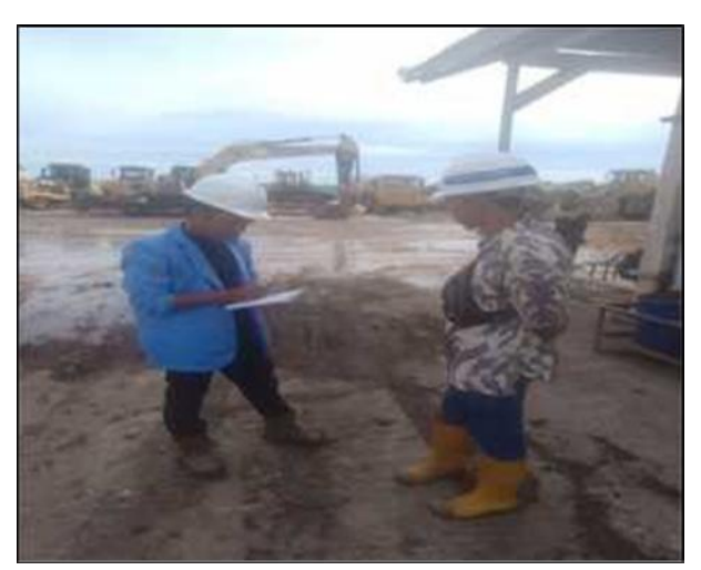
Figure 2. Interview on Pump Formant

The first process carried out by PT LCL is the pumping of AAT, which is carried out from within the mine or mining area (sump) into KPL main sump 2, using a pump with a capacity of 2200 m3/hour with a voltage of 6000 volts according to Mr. Rizal as the electric force of the pump (Figure 4.2). In pumping AAT into KPL, there is no fixed time duration or adjusted to the height of AAT at the last KPL.