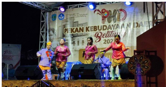
Figure 2 Campak Belitung