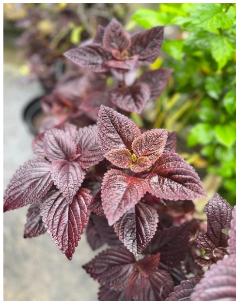
Figure 1 Leaves Neruse

In the implementation of Selamat kampong, there is a series of Selamat kampong tradition events with an arrangement of activities, as follows: