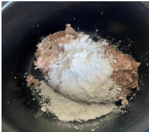
Figure 1 Dough added tapioca flour.