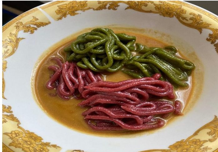
Figure 7 Putu Mayang Ready to Serve

In the use of brown rice flour, as much as 50% of the results obtained from the color aspect have shown a change from the usual color results, the taste does not taste brown rice flour, and the aroma does not smell of brown rice flour, and the texture obtained is still a little soft. To get a putu cake formula with good use of brown rice flour, it was continued with an increase in the amount of brown rice flour used by 25% of the amount of brown rice flour in the previous trial. This is intended to optimize the use of brown rice flour in putu mayang cake products. Here is a picture of putu mayang cake with 50% innovation: