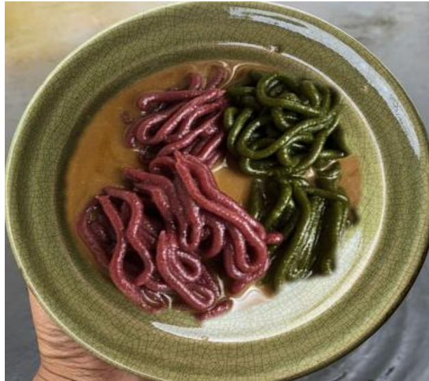
Figure 9 Putu Mayang Cake Innovation with 75% Innovation

of 25% of the total amount of brown rice flour in the previous trial. The following is a picture of putu mayang cake with 75% brown rice innovation: