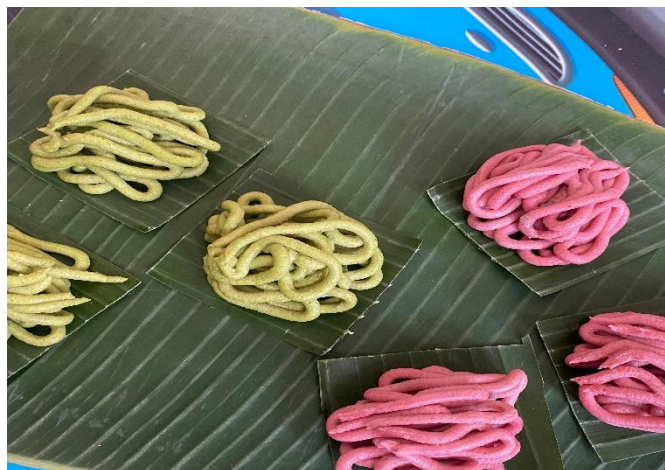
Figure 4 Dough after printing