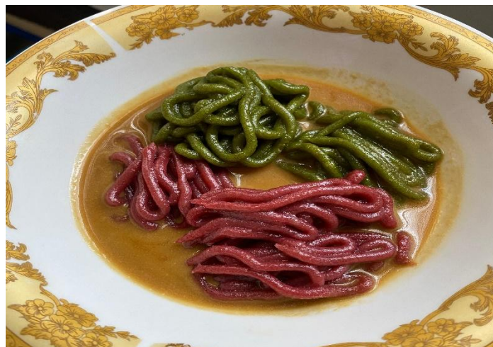
Figure 8 Putu Mayang with 50% Brown Rice Flour Innovation

In the use of brown rice flour, as much as 50% of the results obtained from the color aspect have shown a change from the usual color results, the taste does not taste brown rice flour, and the aroma does not smell of brown rice flour, and the texture obtained is still a little soft. To get a putu cake formula with good use of brown rice flour, it was continued with an increase in the amount of brown rice flour used by 25% of the amount of brown rice flour in the previous trial. This is intended to optimize the use of brown rice flour in putu mayang cake products. Here is a picture of putu mayang cake with 50% innovation: