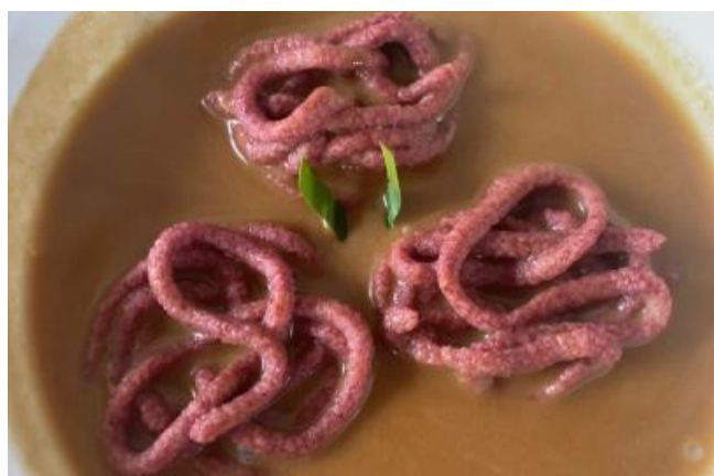
Figure 10 Results of 100% Brown Rice Innovation on Putu Mayang Cake

In the use of brown rice flour as much as 100%, the results obtained from the color aspect have shown a change to brownish pink, the taste feels brown rice flour, the aroma is somewhat brown rice flour, and the texture obtained is rather soft. Based on the results of this trial, after consulting with the supervisor, the formula for brown rice flour putu mayang cake in the brown rice flour putu mayang cake research was carried out with a limit of 100% brown rice flour. The following is a picture of putu mayang cake with 100% brown rice flour innovation: