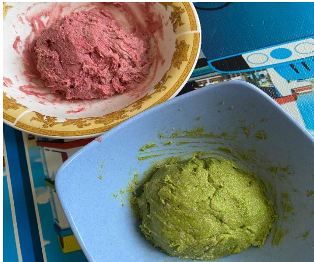
Figure 3 Dough after dividing