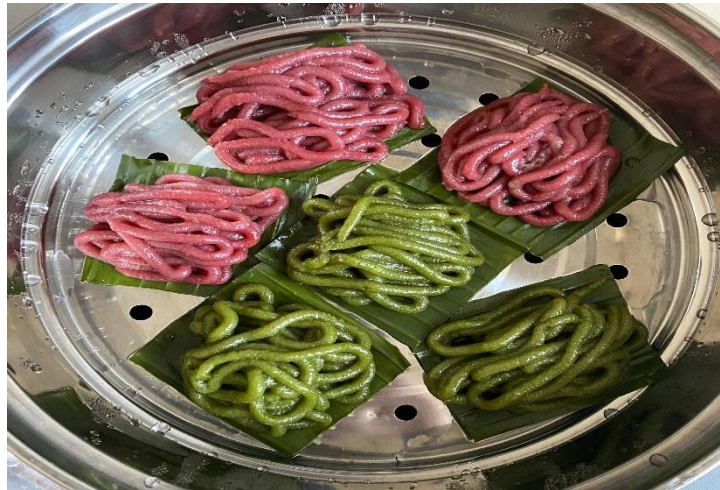
Figure 5 Dough in a steamer