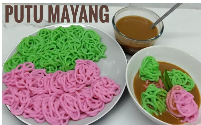
Picture 11 Ordinary Rice Putu Mayang Cake

rice flour the texture tends to be rougher, and for the color aspect if more brown rice flour is used, the color will become darker, besides that in terms of taste it is not so different but for the use of more brown rice flour then for the taste it, still tastes good. Based on some, the use of more brown rice flour will add a more delicious aroma so that in more use it can produce a more delicious aroma. In terms of appearance, more use of brown rice flour, then the appearance will not affect because it still looks attractive in any form because, from a typical point of view, putu mayang cake looks attractive and unique.