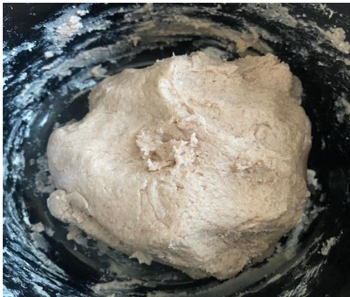
Figure 2 Dough after mixing Well