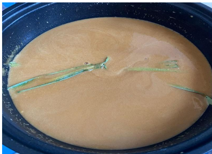
Figure 6 Boiling Brown Sugar Dough