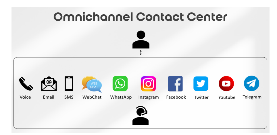
Figure 2 Omnichannel Contact Center Service

This type of omnichannel focuses on helping businesses provide customer service centers over the phone. This system helps record customer conversations. The recording will be saved and synchronized automatically with other channel data (Caroboka, Zianaida, & Zabir, 2023). In addition, this system also provides customer information from various channels during the call center team. Thus, they can serve customers faster and better.