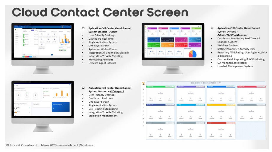
Gambar 3 Cloud Contact Center Screen

Using Cloud Contact Center for Omnichannel can maximize all channels connected to customers for CRM and collect other data to increase sales or service.