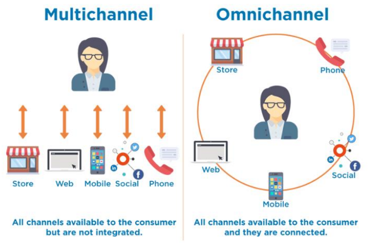
Figure 1: Difference between Multichannel and Omnichannel

Many businesses use this Omnichannel approach to align services and consistency across each channel. So, all communication and interaction can run similarly in all business channels (Safitri, 2023).