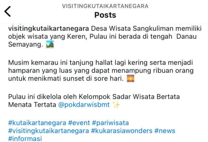
Figure 3 Use of Hashtags in Instagram Uploads @visitingkutaikartanegara

Based on the image above, it can be said that looking at the content strategy, @visitingkutaikartanegara utilizes various types of content to attract and maintain the attention of the audience to build a strong digital presence. Digital Branding on each of these contents displays the Kukar Asia Wonders slogan logo which is contained in every content video uploaded by @visitingkutaikartanegara. Eye-catching visuals are also important to grab the attention of users who are browsing Instagram. Stories and Narratives, where each upload is accompanied by informative and interesting captions, provide additional context about the image or video. This can be a description of the activities that can be done in Kutai Kartanegara, the history of the place, or testimonials from visitors. The use of #VisitingKutaiKartanegara or #KukarAsiaWonders hashtags, in which case relevant and popular hashtags are used to increase the visibility of posts , can reach a wider audience .