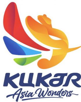
Figure 4 Logo and/or Tagline of the Kutai Kartanegara Regency Tourism Office

The image above is the logo as well as the tagline of the Kutai Kartanegara Regency Tourism Office which is the branding of tourism in Kutai Kartanegara. Lembusuana is the embodiment of an extraordinary animal or creature as a symbol of power and sovereignty of the Kutai Kartanegara Kingdom. In the past, according to the story, Lembusuana was the mount of Princess Karang Melenu or also Princess Junjung Buih who later gave birth to the kings of Kutai Kartanegara. And then the lembusuana was used as a vehicle by Batara Guru.