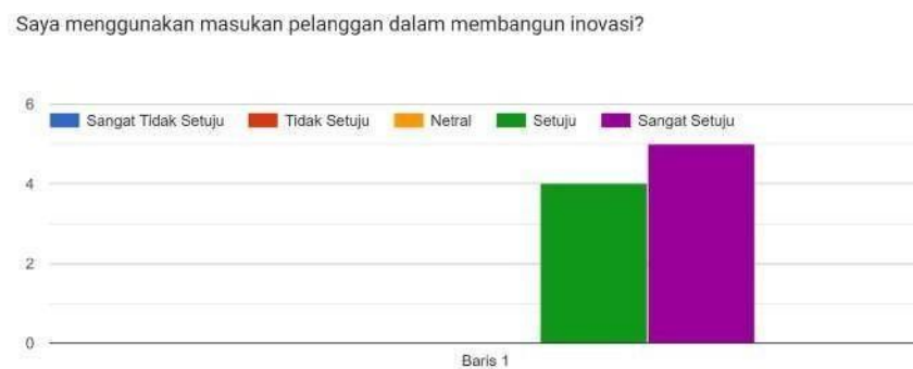
Figure 4 Customers as the basis of corporate innovation

The process of exploring the vision and mission using the questionnaire method to the management of PT. Adhimix RMC Indonesia. The respondents who took part in this survey were 9 people ranging from commissioners, directors, managers and division heads and the results are as follows. In figure 4.8 the question "I use customer input in building innovation" shows that as many as 5 company management people strongly agree and 4 other people answered yes, this is according to the management of PT. Adhimix RMC Indonesia agrees that innovation must be done through the process of understanding the needs and problems of customer input. In figure 4.9 with the question "To what extent do you believe that the development of human resources and technology can help the company achieve its vision to be at the forefront of the readymix industry?" resulting in the answers of 6 people are very confident and 3 people are confident, this states that the company's management is confident that the development of human resources and technology makes the company at the forefront.