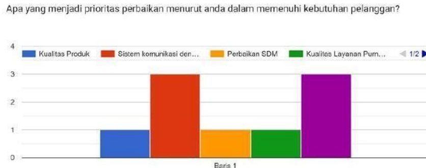
Figure 6 Company improvement priorities

Figure 4 shows the company's management priorities in improving its business processes and services and the results are as follows. Three management people stated the need to prioritize improving the communication system and 3 other people answered that business processes are a priority for improvement to advance the company. One person stated that the quality of after-sales service was a priority for improvement and the other 2 management people answered different priorities, namely improving human resources and product quality. From these results, it can be concluded that the management of PT. Adhimix RMC in a question about the company's vision that innovation and company development are based on customer input with priority improvement in terms of customer communication and after-sales processes through human resource and technology development.