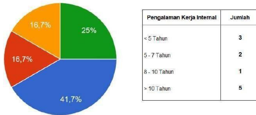
Figure 2 Respondent experience persona