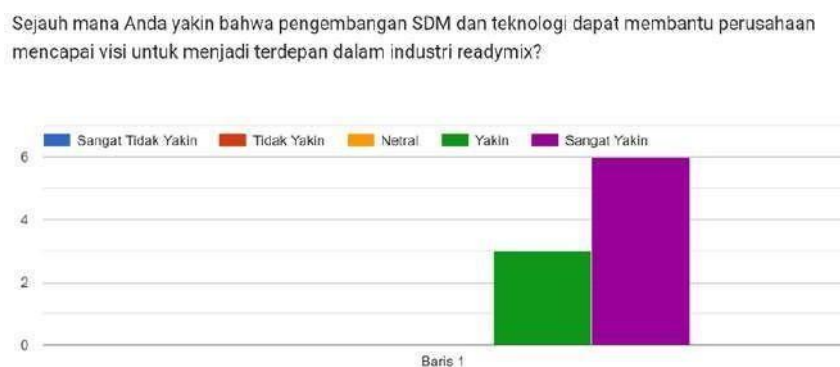
Figure 5 The level of confidence in the company's growth through human resource and technology development