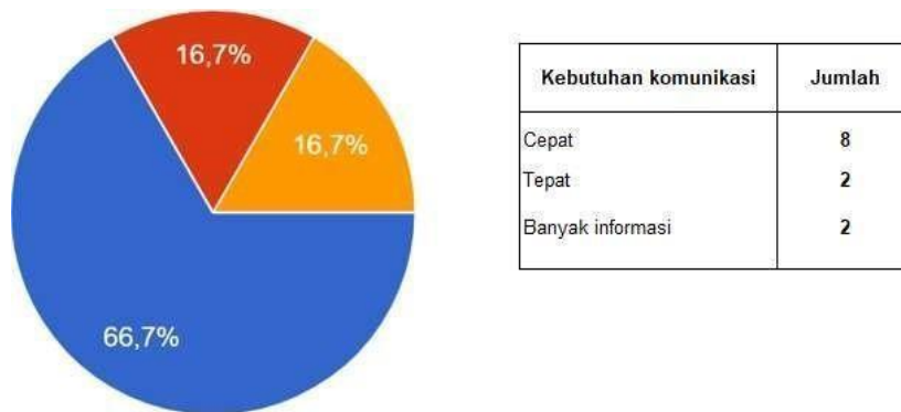
Figure 3 Communication needs by customers