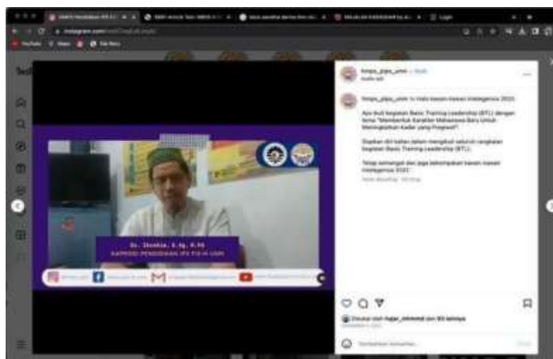
Picture 1 Video Narration of the Head of PIPS FIS-H UNM Study Program

When the sun begins to set on April 21, 2023, the author again traces the historical traces as a story of the seduction of knowledge discourse. Through video reels, @hmps_pips_unm's Instagram account started promoting LDKM to new students (mamba) PIPS. If possible, the author is like an advertisement promoting knowledge products suitable for consumption by consumers of new students (mamba) PIPS. Of course, a product advertisement uses an actor/artist, the Head of the PIPS Study Program. As shown in the video ad screen that reverberated throughout the hearing of PIPS first-year students,