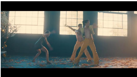
Figure 3. Yellow Segment

Myth: Some religions still cannot accept the presence of LGBTQ+ people because they are considered sinful and distance themselves from God.