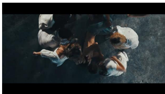
Figure 5. Blue Segment

Myth: Hatred against LGBTQ+ people is still prevalent in the surrounding environment in the form of verbal abuse and physical abuse that can endanger the lives of people in the LGBTQ+ group