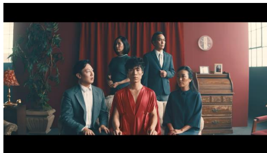
Figure 1. Red Segment

The video is divided into segments marked with different colors: red, orange, yellow, green, blue, and purple. These colors symbolize the pride flag of the LGBTQ+ group.