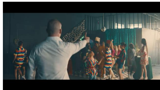
Figure 4. Green Segment