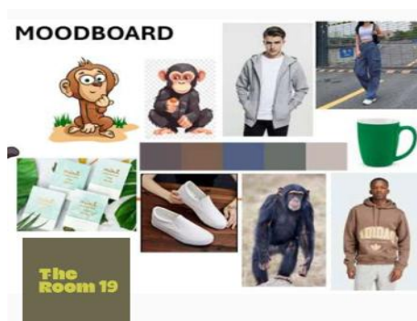
Figure 4. Moodboard

Designing a mascot begins with making a mood board. A mood board is a tool or board media commonly used by a designer to establish an initial reference point for a design concept (Gatto et al., 2011). Here is the mood board for The Room 19 mascot.