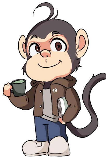
Figure 5. The Room 19 Mascot Design