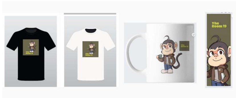
Figure 7. Merchandise

Experiment with adding mascots to specific merchandise such as t-shirts, mugs, posters, and others.