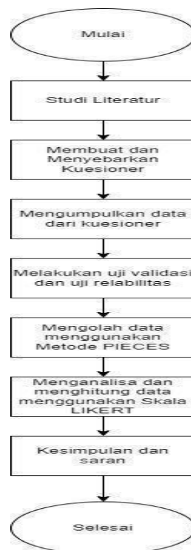
Gambar 1 Alur Penelitian

In this chapter, the stages of research carried out in this study will be explained. This study begins with a literature study, data collection, data processing, data analysis, and data calculation.