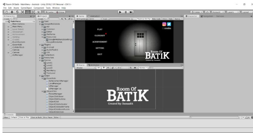
Figure 2. Unity view as you work

The programming process in making the game "Room of Batik" uses the Unity Game Engine, after the prototype is completed and other assets are also completed, then the temporary assets used in the prototype are replaced with the assets that should be.