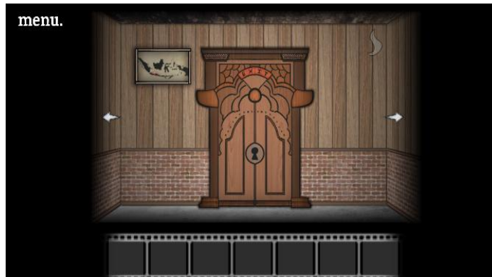
Figure 3. Example of "Room of Batik" gameplay with ready-made assets

All visual assets in the game "Room of Batik" are 2-dimensional. All of its assets are created using Adobe Photoshop. These visual assets include UI, background, and puzzle objects. In the game "Room of Batik" there are no characters so there is no need to make the character visuals.