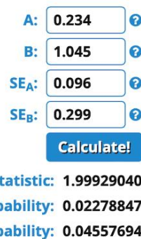
Figure 2 Results of the Sobel Test of Facility Variables The decision to Send Children to School Through Brand Image

Based on the calculation results, the statistical value of Sobel obtained is 1.9993 with a significance value in the one-sided test of 0.023. Because the p-value < 0.05 , it can be concluded that Facilities (X2) have a significant effect on the Decision to send children to Playfield (Y) through Brand Image (Z). To find out the indirect influence of X2 on Y through Z, the calculation of the multiplication of the beta value of X2 to Z and the beta