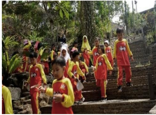
Figure 1 of the playing page

Based on the analysis carried out with the theory of tourism village development, the condition of the children's game program in Alam Santosa still needs to be improved to be by the criteria of a tourist village. According to the Tourism Village Guidebook (2021), the development of tourist villages, one of which is through the development of tourism destinations, needs to pay attention to aspects of tourist attractions, public facilities, tourism facilities, accessibility, and interrelated communities so that they can complement the realization of advanced tourism. Three important aspects need to be considered in the development of tourist villages, but the most basic aspect is attractions.