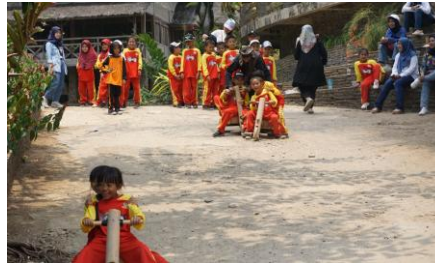
Figure 2 Juvenile Games

The implementation of the children's game program in Alam Santosa involved participants from elementary school students in grades 1 to 6. During the activity, participants were accompanied by homeroom teachers and parents of students. The involvement of homeroom teachers and parents aims to provide additional supervision to each child, even though there is already a person in charge of the organizer of the activity. The activities carried out lasted quite a long time with various kinds of activities that contained positive values. The following is a series of activities carried out by each student during the children's game program.