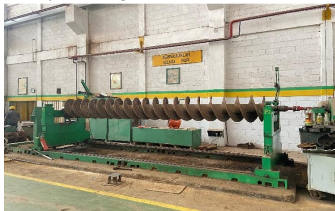
Figure 2. Screw Conveyor Balancing Testing Tools

Previously, testing the data of the equipment to be balanced such as name, dimension (mm), Radius (mm), and Tolerance (g), In the process of working the machine itself by analyzing the vibration that occurs in the machine, during the testing of the unit to be tested previously weighing is carried out to obtain the data required by the balancing machine, then placed on the platform or bearing, after which the unit will be rotated through a belt or end drive, During the process of playing the unit, it will produce vibrations, the vibration is detected by the sensor on the machine, the sensor produces data from the vibration that occurs in the unit and will appear on the digital display screen of the machine, from the results which part of the unit is not balanced with the engine, and later there will be an addition or reduction of mass in that part so that the unit can be balanced again. Parts or components that are often balanced in the fabrication department include screw conveyors from factory II using horizontal balancing machines with balancing grade 2.50G with Std ISO 1940 in the workshop and fabrication department.