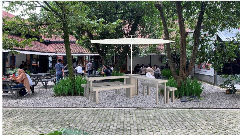
Fig 6 Design Implementation