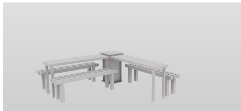
Fig 5 Final design