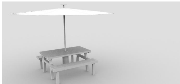
Fig 1 Alternative Ideas 1

At the ideate stage, design parameters will be used through the criteria in previous research. The design parameters obtained are facilities used in outdoor spaces in communal areas should be movable, can adapt to weather changes, and support communal activities. Here are alternative ideas: