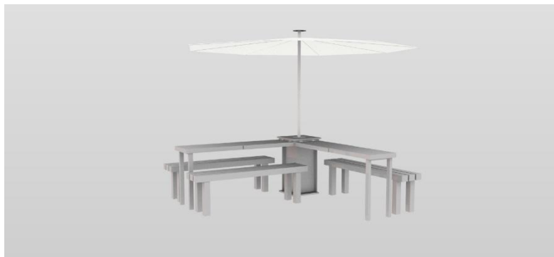
Fig 4 Final design

At the prototyping stage, the final sketch that has been developed will be visualized in 3D. 3D prototyping using rhinoceros 6.0 software.