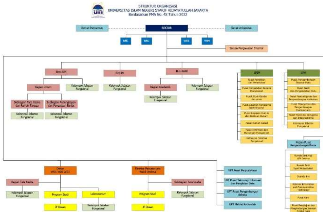
Figure 2 Structure UIN Syarif Hidayatullah Jakarta organization after Simplification Bureaucracy based on Regulation of the Minister of Religion Number 43 of 2022

Under the chancellor is also there unit of internal supervision that carries out supervision non-academic at UIN Syarif Hidayatullah Jakarta. The hope with the existing simplification structure this more make work units easier smallest in do make decisions strategically especially related to service public, so can increase the performance organization. Structure drawing UIN Syarif Hidayatullah Organization Jakarta post Simplification Bureaucracy shown in Figure 2 below.