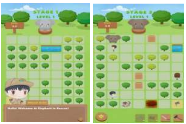
Figure 7 In-game Elephant in Rescue

Here is what it looks like for the game Elephant in Rescue. At the beginning of each level, players will be shown a mink aldo monologue containing information about Way Kambas National Park. After that, players will play with a predetermined backward time. After the game enters the prototype production stage that can be played, it is done Game testing of 25 respondents revealed the shortcomings and responses from a group of players to the game that had been made. Testing is carried out by providing links to respondents to try the game; then, the players are asked to answer several questions related to the game that has been played. The data found are as follows: