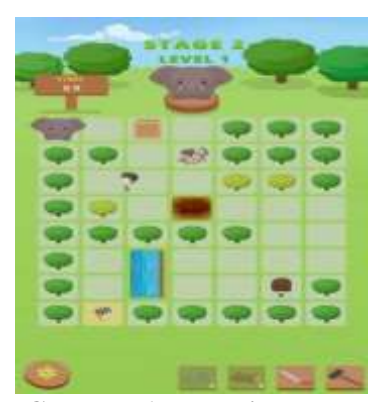
Gambar 6 Mekanik Batu

The game includes large rocks in addition to trees of different colours. These large stones can be used to add small stones to the inventory and to hoard obstacles, holes, and spikes.