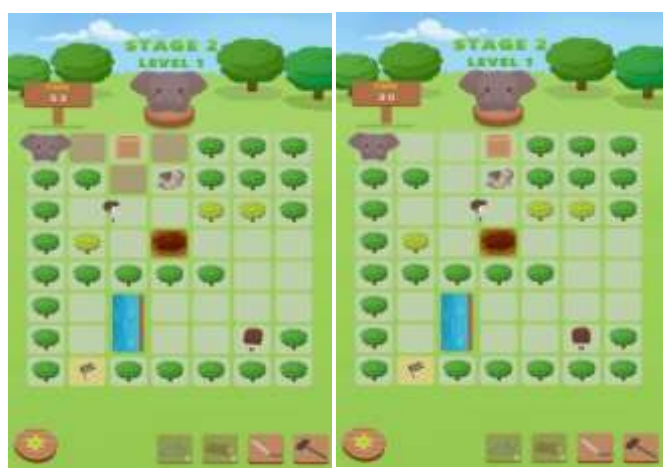
Figure 4 Mechanical Slide Box

The slide box mechanic is a reference to the Sokoban tap game mechanic. Players must slide the box that blocks the elephant character from finding a way out by clicking the box. A light will appear as a clue as to which box will be shifted in which direction. Then, click on the light, and the box will shift.