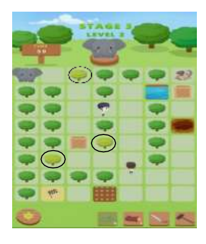
Figure 5 Mechanics of Different Color Trees

Different-colored tree mechanics are puzzle mechanics applied in this game. To use them, click the cleaver inventory and click on a tree different in color from most trees. After that, when you have cut down trees, the wood inventory will increase, and it can be used to build bridges if there are river obstacles. This different-coloured tree will also save players when they cannot find a way out by making new roads.