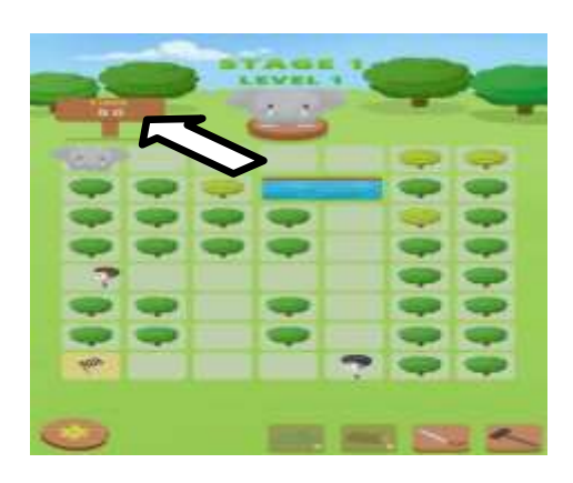
Figure 2 Reverse time mechanics

When playing, there is a timer that counts down the duration of playing time in one stage. This time will later be accumulated according to what has been determined in the table above. When the time is up, the game will finish, and the player will lose.